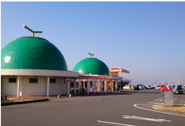
Figure 1: Michinoeki Shichijo Melon Dome, in Kukichi city, Kumamoto prefecture, Japan 1

One notorious example, based in the Kumamoto prefecture in the Kyushu area is 'Michinoeki Shichijo Melon Dome', pictured in Figure 1. The local product is, of course, melon, and they have used it to make melon taste 'Melon Pan' bread (which is named after its shape and not the taste), ice cream and also sold on its own. The place also offers other local souvenirs and products, aside from melon-based ones.